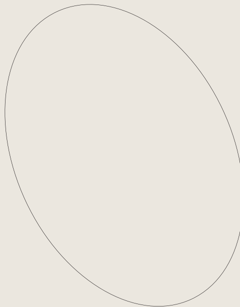
TexScreen® is a registered trademark of Altex®.

Lead Free: RoHS/Directive 2002/95/EC, US Consumer Product Safety Commission Section 101, ANSI/WCMA A100.1-2007 for lead content, REACH (EC 1907/2006)